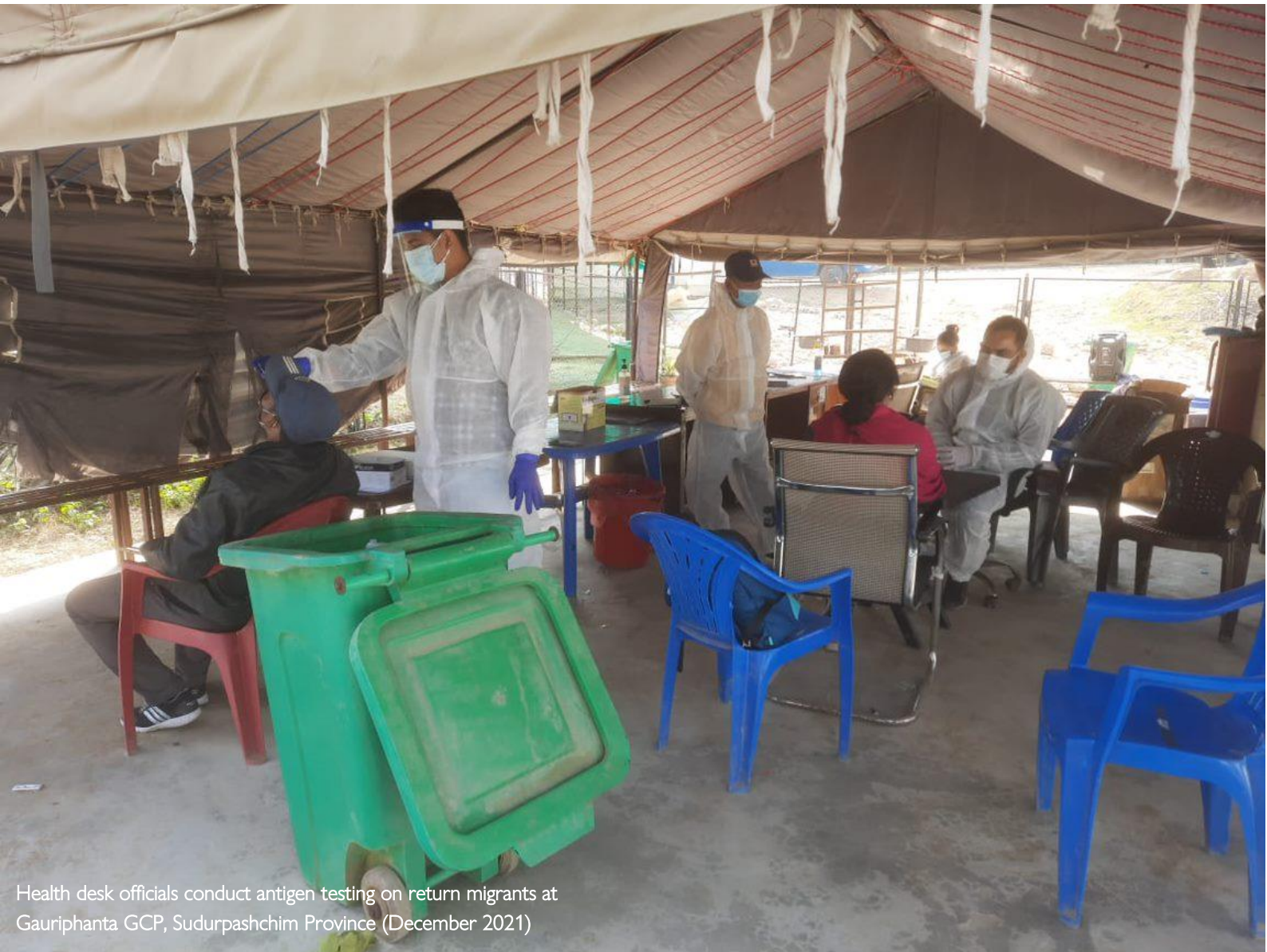
Health desk officials conduct antigen testing on return migrants at Gauriphanta GCP, Sudurpashchim Province (December 2021)