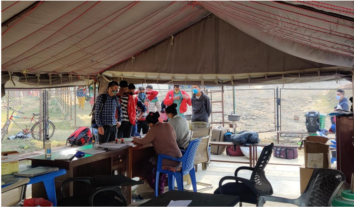
Picture 6: Staff are screening return migrants at the health desk prior to the testing at Gauriphanta GCP, Sudurpashchim Province (December 2021).