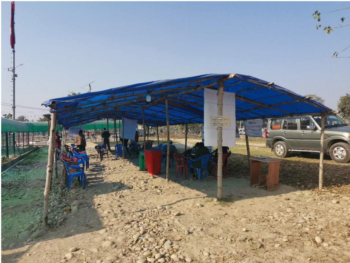
Picture 7: Holding centre at Gaddachauki GCP, Sudurpashchim Province (December 2021).