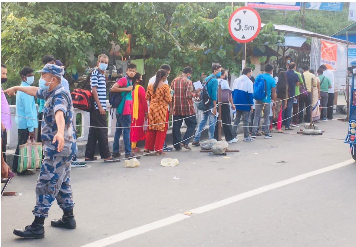
Picture 5: Migrants wait in line to the health desk at Kakarbhitta GCP, Province 1 (October 2021).