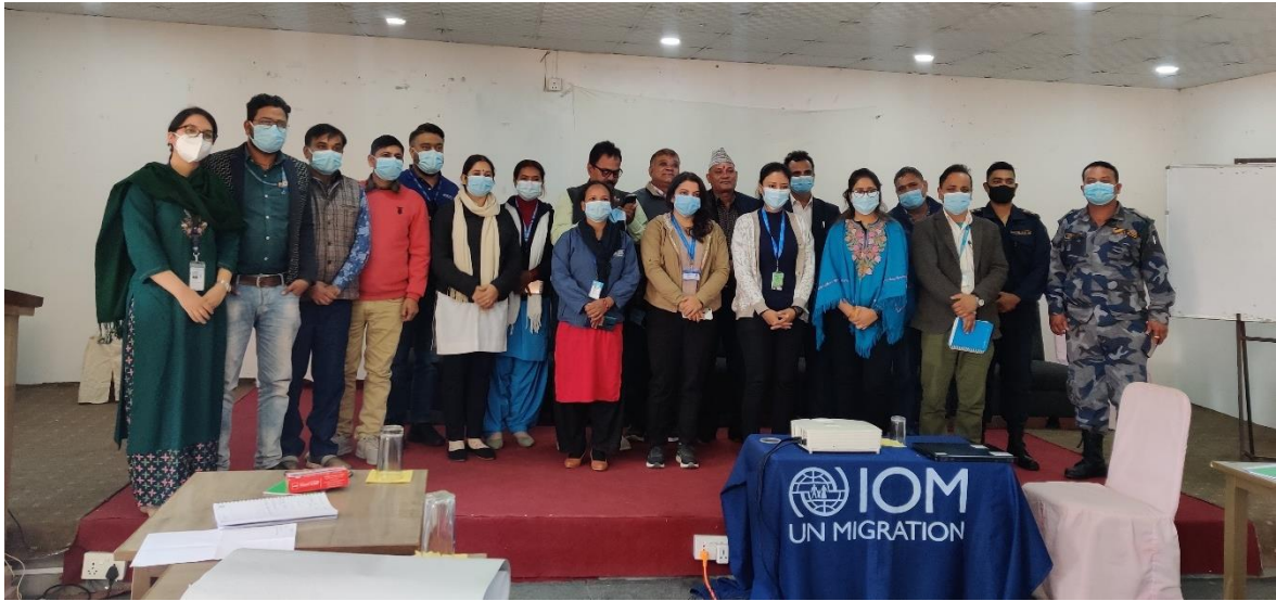
Picture 2: Group photo with IOM assessment team and participants at the stakeholder consultation concerning Krishnanagar GCP conducted in Kapilvastu, Lumbini Province (December 2021).