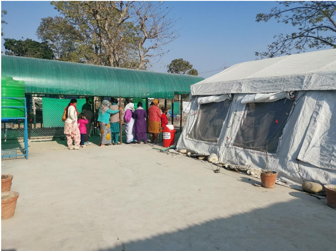
Picture 3: Migrants wait in line at the health desk to be tested at Gaddachauki GCP (December 2021).