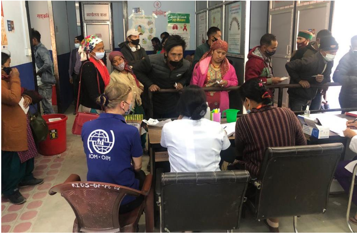
Picture 4: Migrants registering at the health desk at Jamunaha GCP, Lumbini Province (December 2021).