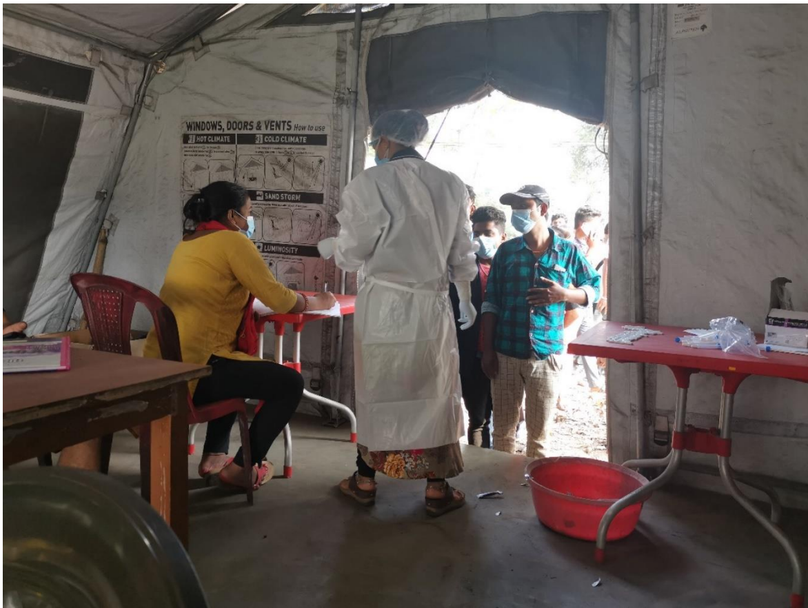
Picture 1: Antigen testing is being conducted at the health desk at Inarwa/Birgunj GCP, Province 2 (October 2021).